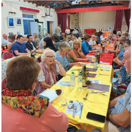
Diners enjoying the meal in Marlingford village hall.