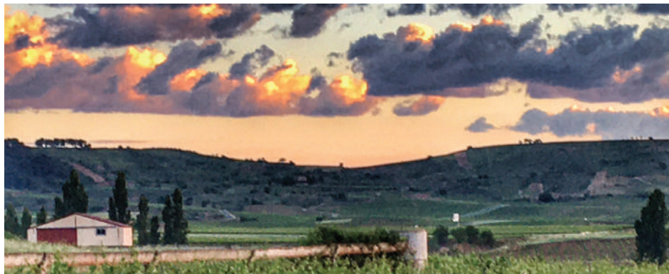
A spectacular view en route.