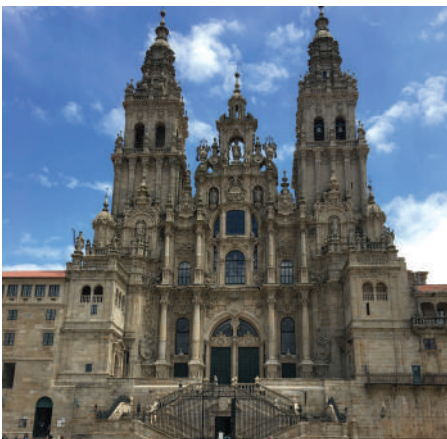
Santiago di Compostela cathedral.

Setting off through the Pyrenees, I realised almost immediately that I had made two miscalculations – I wasn't as fit as I thought I was and, despite my careful planning, my rucksack was still too heavy even at only seven kilos. From the start, I struggled with the uphill walking from St Jean, having to stop every 10 to 20 paces to catch my breath, shoulders aching from the weight of my backpack, feet dragging me up the steep slopes, while fitter, younger pilgrims raced past me. Now, I honestly questioned my sanity in doing this trip. What a relief it was to reach the first hostel, when, after a beer and meeting up again with my new companions, my struggles were all but forgotten. The Pyrenees scenery was spectacular with mountain tops and wild horses appearing out of the mist in the early morning.