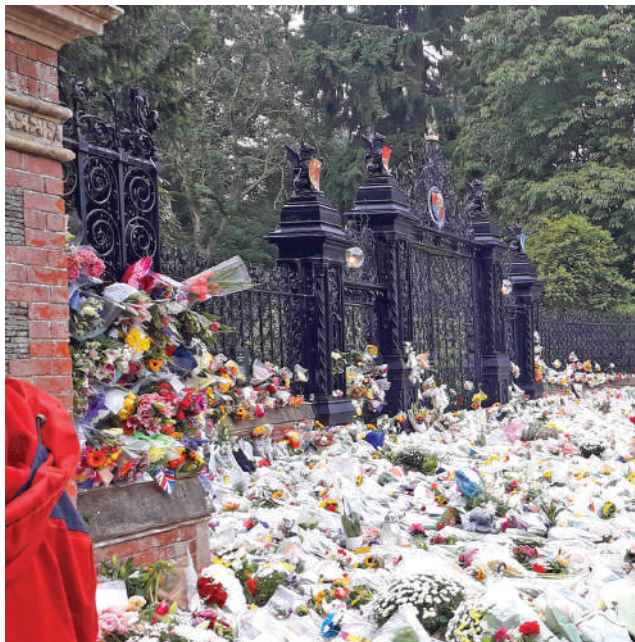
Flowers laid at the gates of Sandringham House following the Queen's death.