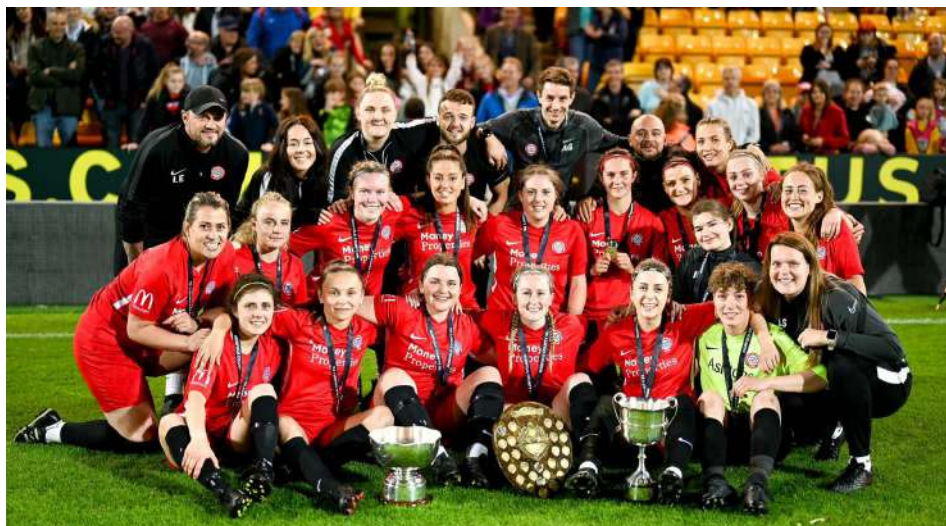
Wymondham Women clinch the Norfolk County Cup at Carrow Road in May.