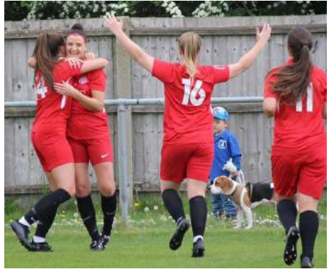
Wymondham Women celebrate a goal and be active.

Alongside the top teams of Norwich City Women and Wymondham Women, there are clubs in Thorpe, Sprowston, Dussindale and Hellesdon, and Horsford, as well as elsewhere across the county. Meanwhile, the innovative Weetabix Wildcats initiative is introducing many young girls to the game and has seen a number of teams spring up in the last couple of years. Weetabix Wildcats football offers girls aged 5-11 a chance to try football for the first time and provides regular opportunities to play in hour-long sessions. All sessions are delivered by FA qualified coaches in a safe place for girls to try football and develop key football skills, as well as have fun